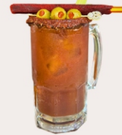
Ojo Rojo 32 oz

1800 Cristalino 15 · Herradura "Ultra" 18 · Clase Azul Mezcal 25 · Don Julio 33 · Don Julio 70th Anniversary 25 · Jose Cuervo Reserva de La Familia 28 · Maestro Dobel 50 Extra Añejo 28 · Clase Azul Extra Añejo 195 · Xicano Mezcal 11 · Casamigos Mezcal 18 · Herradura Suprema 65