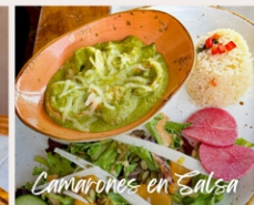
Camarones en Salsa