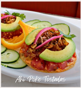
Ahi Poke Tostadas