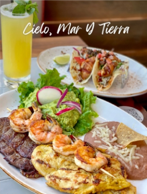
Cielo, Mar y Tierra