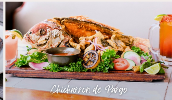
Chicharron de Pargo