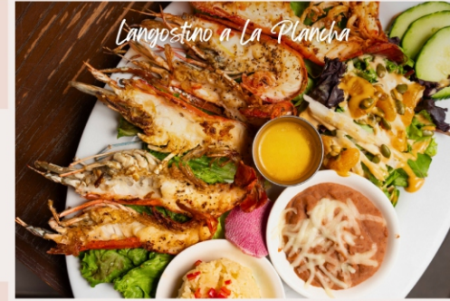
Langostino a La Plancha