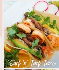
Surf 'n' Turf Tacos