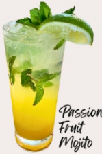
Passion Fruit Mojito