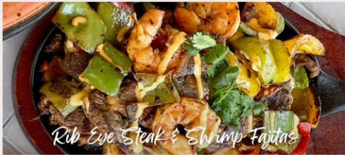
Rib Eye Steak & Shrimp Fajitas

Seasoned braised pork accompanied by guacamole, salsa asada, rice & beans.