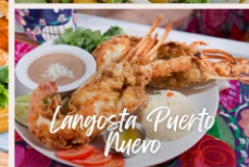
Langosta Puerto Nuevo