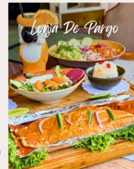
Lonja De Pargo

Enchilada filled with tender crab and shrimp, paired with a roasted Poblano chile stuffed with scallops, shrimp, and lobster. Both are finished with Karina's signature spicy Poblano sauce and a touch of crema. Served with rice and beans.