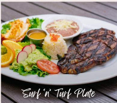
Surf 'n' Turf Plate