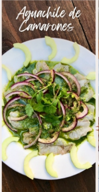
Aguachile de Camarones

Shrimp marinated in a lime and chile serrano sauce with red onions and avocado. Topped with cilantro & cucumbers.