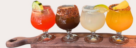
Margarita Flight $35

Mango, Watermelon, Lime & Tamarindo 9 oz margarita samplers